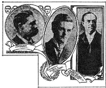
Headline from the San Francisco Chronicle on March 3, 1905.

While many of the 19th century Japanese visitors to the U.S. were sojourners seeking adventure, education, and even economic opportunities, little did they anticipate that if they decided to stay permanently in this country, any move towards naturalization would be barred by an Act of Congress passed in 1790, which allowed only ‘free white men’ to be naturalized (Chuman, 1976). The Chinese Exclusion Act of 1882 aided (by favoring) Japanese immigration to America, but not for long (Takaki, 1989). In early 20th Century, California passed its Alien Land Law (1913), which used the indefinite alien status of Japanese and other Asians to prevent them from acquiring real estate, and setting down permanent roots. The California law was soon mimicked by other western states (Chuman, 1976). Japanese and other Asian immigration was finally turned off by the passage of the U.S. Immigration Exclusion Act of 1924. Japanese immigration was halted until the 1952 passage of the McCarran-Walter Act. This historic act allowed Issei (Japanese immigrants) to become naturalized for the first time and allowed immigration to resume (at 185 Japanese persons per year), now without constraints to a person’s country of origin (Maki, Kitano, & Berthold, 1999).