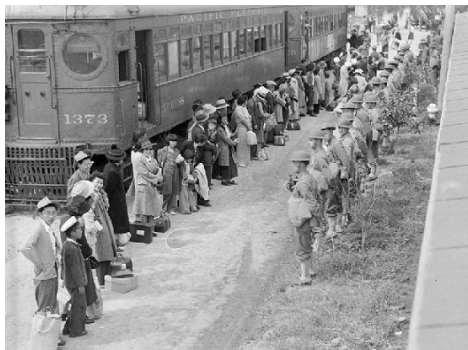
Japanese Americans from San Pedro, California, guarded by soldiers arrive at Santa Anita Race-track, a temporary detention center, in Arcadia, California, in 1942.

Definitions —a euphemism is “a mild word or expression substituted for one considered blunt and embarrassing” (Chantrell, 2002, p.186). It comes from the Greek euphemismos, from euphemizein ‘use auspicious words’. The formative elements are eu “well” and pheme “speaking” (English usage since late 16th century) (Chantrell, 2002). In more modern times, author William Safire (1981) writes: “To some degree, euphemism is a strategic misrepresentation” (p. 82).